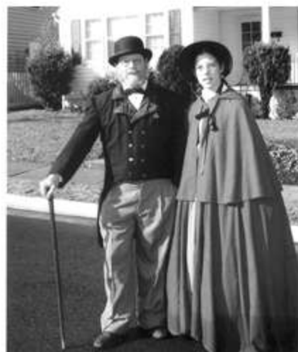
The usual Candlelight tourists...