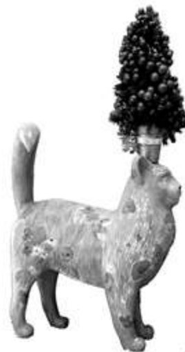
"Poppy Cat" by Betsy Glassie — a 'Pawsitively' prototype, with seasonal headwear!

In fact, HFFI needs a member to put one on our doorstep, too. — be pawsitively historic!