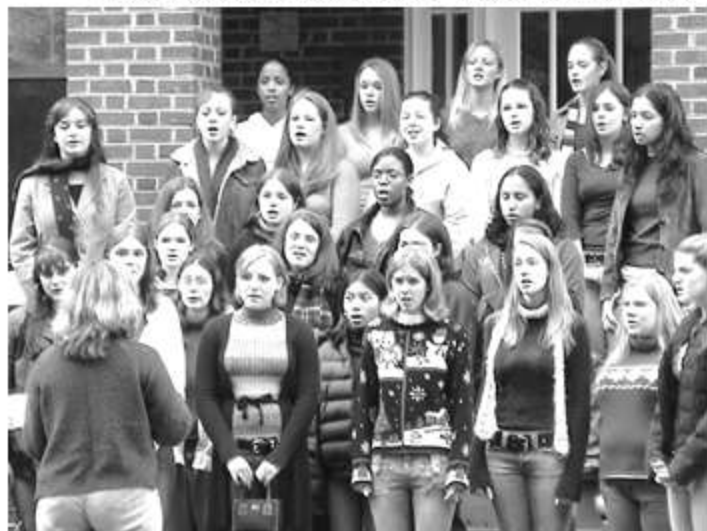
Carolers enlivened the streets of Hanover Heights