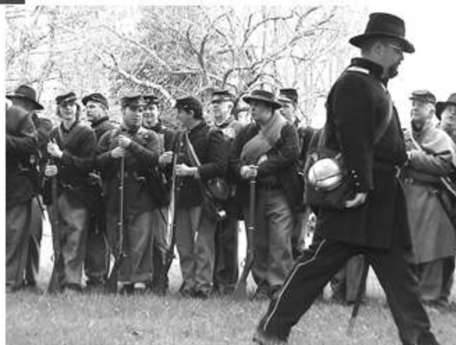
The Yanks got mowed down, again. Just wait til' next year!